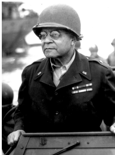
Top to bottm, left to right: Dr. W. Montague Cobb, Nannie Helen Burroughs, The Honorable William H. Hastie, Anna J. Cooper, The Honorable Eleanor Holmes Norton, The Honorable Robert C. Weaver, Elisabeth Catlett, General Benjamin O. Davis