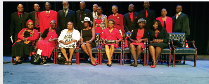
Dunbar High School Class of 1965