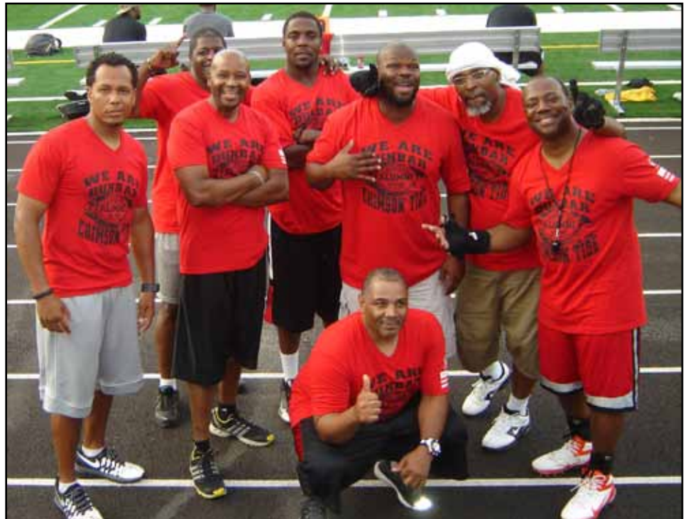
Stadium opening brings back dreams of glory!